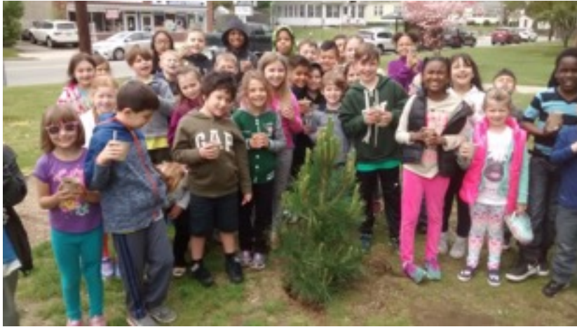
Garden Party with the first and third graders planting a tree that we named Daniel!