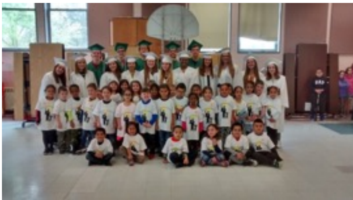
Seniors from East and the Kindergarteners! The East seniors were Waterman students! It was a fun time as members of the senior class paraded through Waterman!